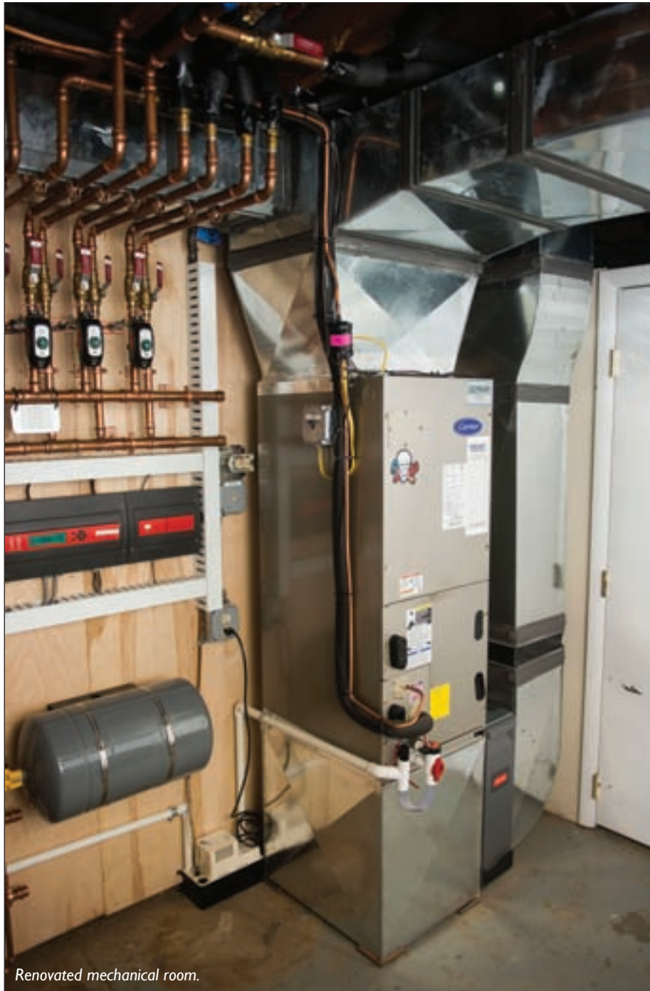
Renovated mechanical room.

system. The third floor guest suite was still cold in the winter and required a window shaker for cooling. The first floor bath was uncomfortable year round, even with the added ductwork. The problem was the thermostat, located in the living room, satisfied long before the bath received enough supply air to be comfortable. The mechanical system was safe and reliable, but comfort issues abounded.