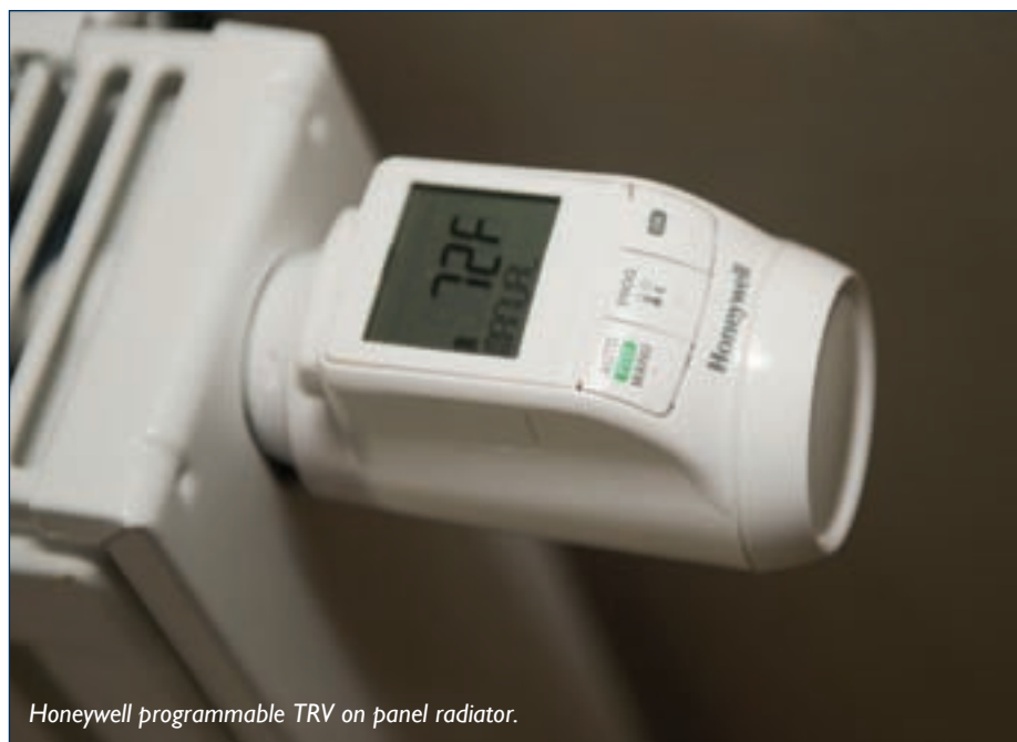
Honeywell programmable TRV on panel radiator.