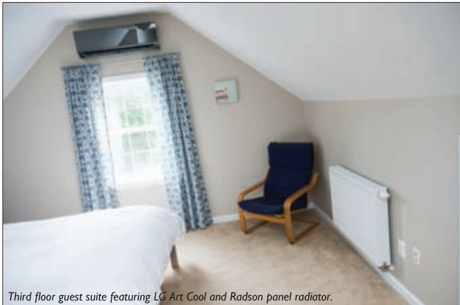
Third floor guest suite featuring LG Art Cool and Radson panel radiator.

The existing duct system was designed to handle only heating airflow, most likely with a belt drive motor. It was undersized and short on return air. We modified the ductwork where it was accessible. We enlarged the return and added a return riser in the corner of the first floor living room. I had the duct boxed in and trimmed and added a large return grille to improve airflow. We also modified and enlarged the supply trunkline. Accessible duct joints were sealed with mastic to minimize duct leakage. All registers and grilles were replaced.