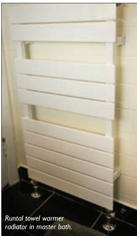
Runtal towel warmer radiator in master bath.