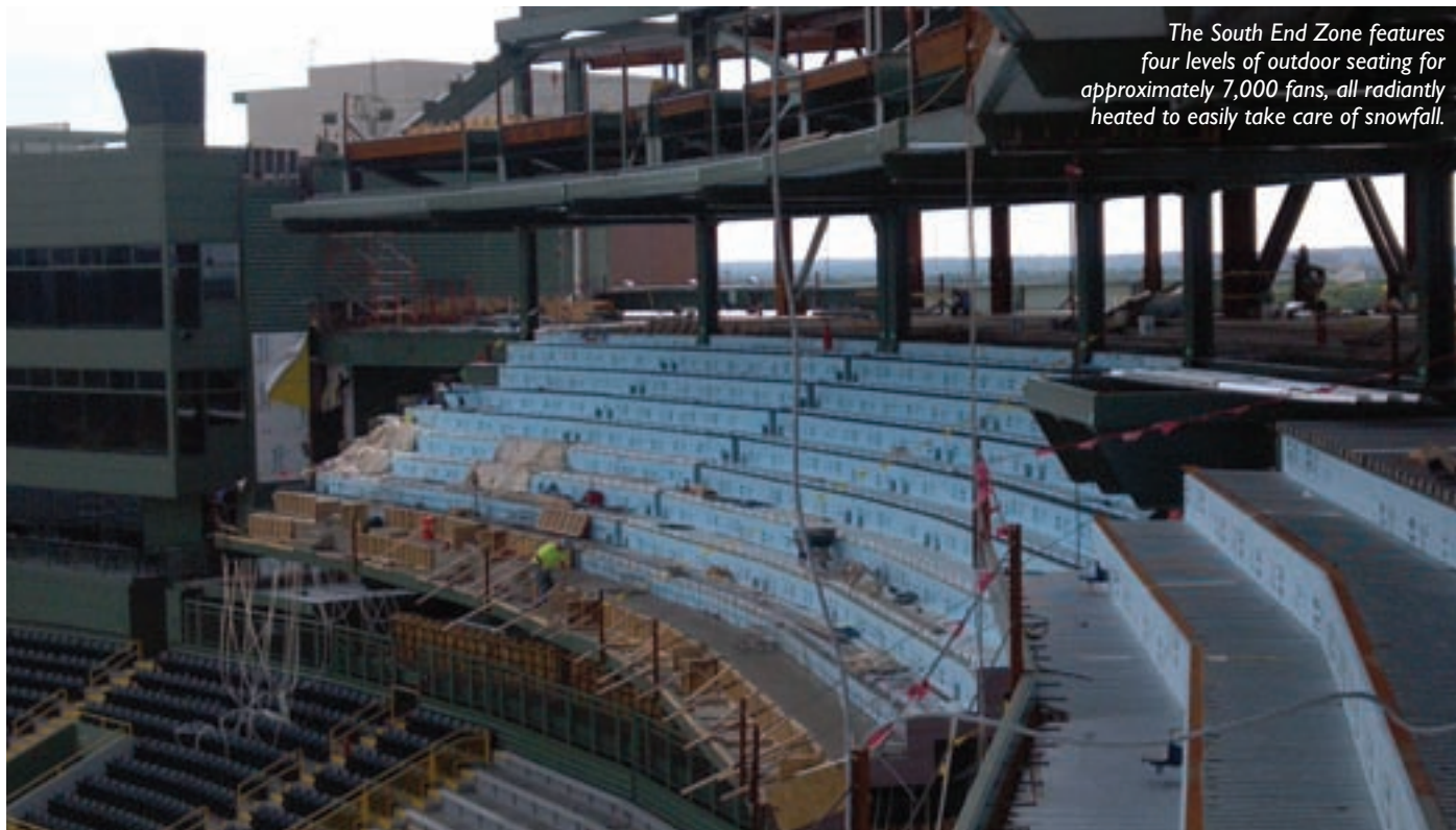
The South End Zone features four levels of outdoor seating for approximately 7,000 fans, all radiantly heated to easily take care of snowfall.