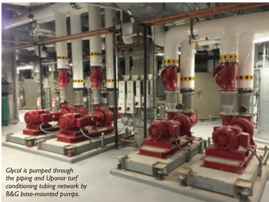
Glycol is pumped through the piping and Uponor turf conditioning tubing network by B&G base-mounted pumps.