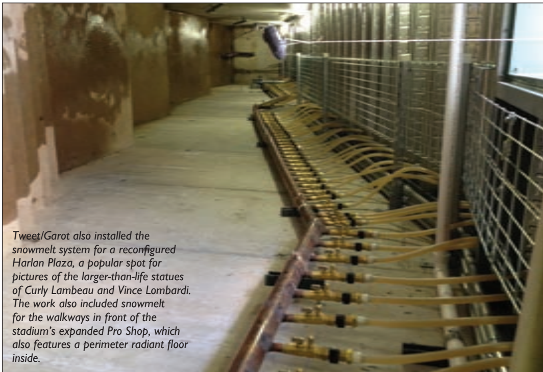
Tweet/Garot also installed the snowmelt system for a reconfigured Harlan Plaza, a popular spot for pictures of the larger-than-life statues of Curly Lambeau and Vince Lombardi. The work also included snowmelt for the walkways in front of the stadium's expanded Pro Shop, which also features a perimeter radiant floor inside.

will tweak, adjust and balance the system until it is working as specified. This attention to detail is noticed and appreciated by his clients, which is why he engenders loyalty from his customers and why he always has a steady backlog of new work.