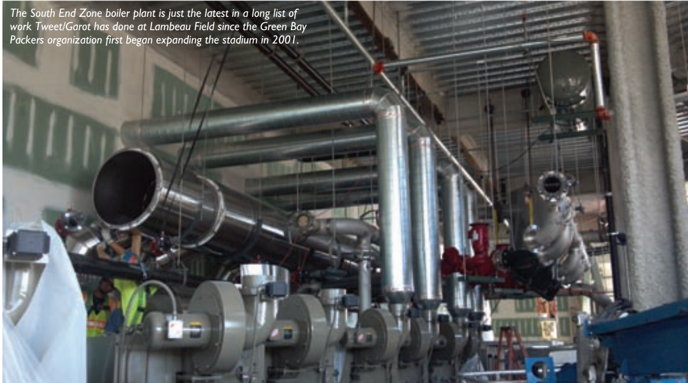
The South End Zone boiler plant is just the latest in a long list of work Tweet/Garot has done at Lambeau Field since the Green Bay Packers organization first began expanding the stadium in 2001.

This bank of boilers is controlled through a custom DDC control system that allows David as well as Lambeau staff to monitor and control the system remotely. Before game day, or after a large snowfall, David will check in to ensure his system is operating properly and that heat is flowing. Temperature sensors installed below the turf field indicate soil temperature and adjust for varying conditions created by wind and shading.