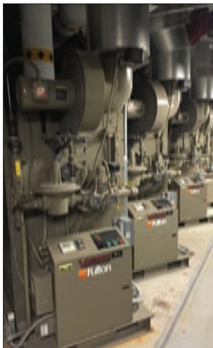
The Tweet/Garot crew installed 12 Fulton Vantage 4M BTU 95 percent thermally efficient condensing gas fired boilers with modulating burners.

Also, just as important to David, this outdoor section of seating will be radiantly heated in four levels that will melt snow as it falls — a concept tested on a small scale during winter 2010. This concept will solve the logistical problem of shoveling snow from an "upper deck" seating area.