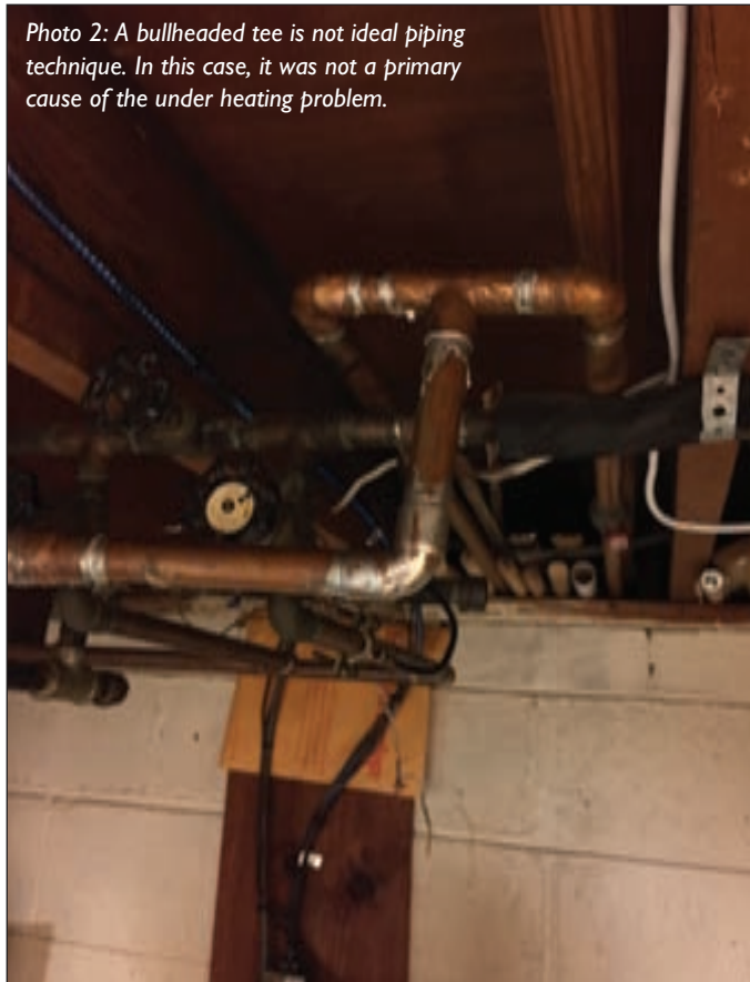
Photo 2: A bullheaded tee is not ideal piping technique. In this case, it was not a primary cause of the under heating problem.

I waited for the boiler to come up to setpoint and checked the returns. The supply split into two baseboard loops. After about 15 minutes of runtime, both returns were hot. This was not a flow or air issue. I did not do a load calculation, but the boiler size passed the eye test. It certainly had the capacity to heat the connected baseboard. If anything, it may have been over-sized. Within 15 minutes of runtime, the boiler was cycling on limit. This did not appear to be an undersized boiler.