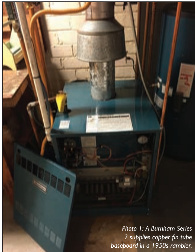
Photo 1: A Burnham Series 2 supplies copper fin tube baseboard in a 1950s rambler.

As the boiler came up to temperature, I sketched out the near boiler piping. Often, there is a maze of piping, and I find sketching it out makes it easier to spot piping problems. In this case, it was not textbook-perfect. The circulator was pumping towards the expansion tank. The primary supply dropped from 1 inch copper to ¾ inch copper, and then ran to a bull-headed tee (See Photo No. 2). While the piping was not ideal, it was not enough of an issue to cause the described deficiencies. It was not a "new" problem, as it had been that way since the boiler was installed.